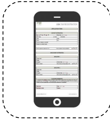
Photo / Scan copy of filled form